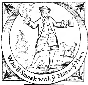
BANKS' COLLECTION OF SHOP BILLS.

Some old authors and artists have represented the